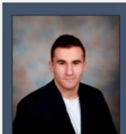
Founder and Ceo "We Buy Property the Only Way the Right Way"